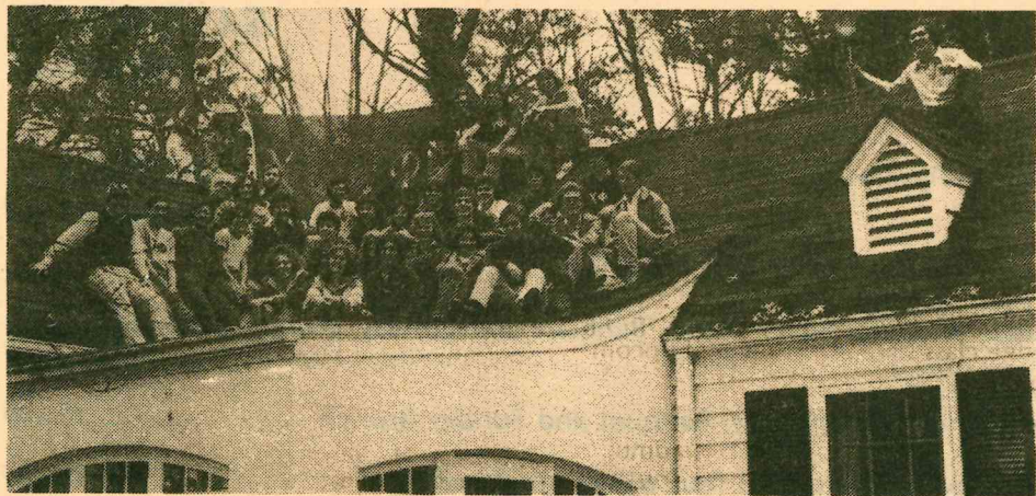
The Rho Delta Chapter in an afternoon outing on the chapter house in Atlanta's Wieuca Road section.