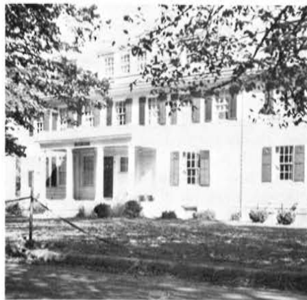
Chapter House at the University of Rhode Island showing new addition (section with four windows on right side of photo).