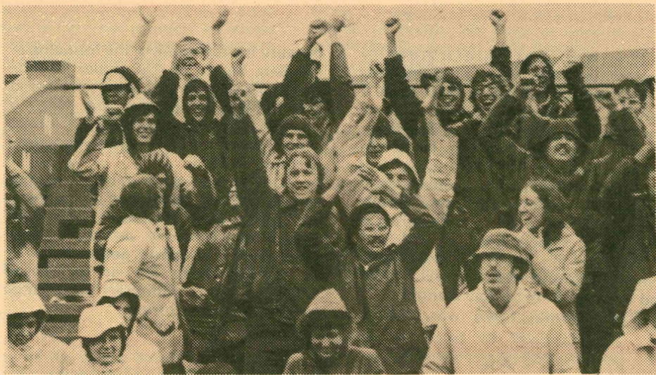
Enthusiasm shows in this picture of the Rho Iota Kappa group during 1976 Greek week. Below is the Chi Phi team in one of the key Greek week events.