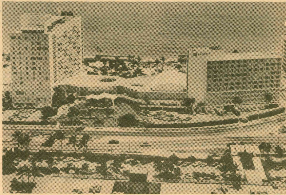
The Americana Hotel at Bal Harbour, Florida, is to be the scene of the 1977 Congress of the Chi Phi Fraternity.