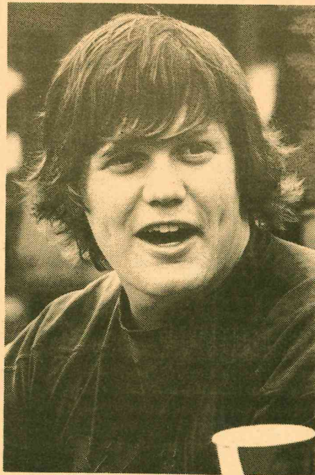
"Well, now, just a cotton picking minute..."