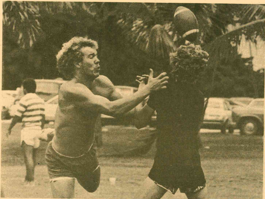
Touch football kept Congress sessions from being "all work and no play."