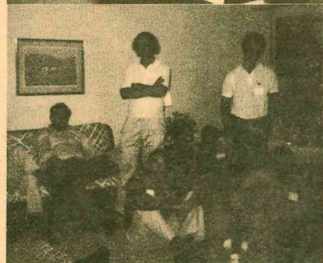
Interest in the Grand Alpha's visit is evident in these scenes from Washington, D.C.